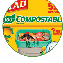
GLAD MANUFACTURING COMPANY