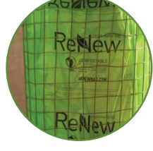
RENEW PACKAGING, LLC