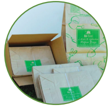
AJM PACKAGING CORPORATION