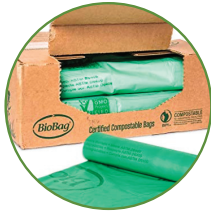
BIOBAG AMERICAS, INC